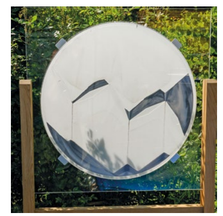
Turning Circle special Version