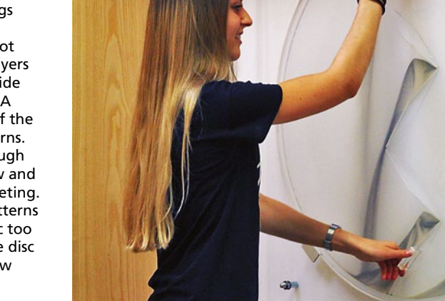
Order No. 10.13500 for wall attachment