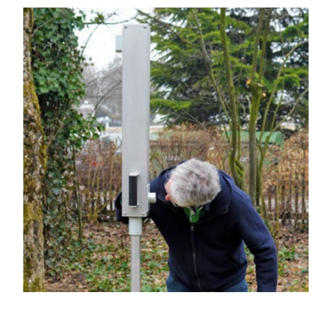
slightly Vandalism vulnerable Supervision not necessary Explanation Board not necessary indoors & Installation outdoors Safety check not necessary (DIN EN 1176) Installation in possible concrete