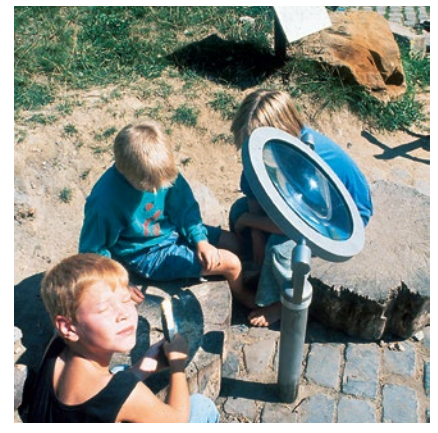
The picture shows the magnifying lens without table.