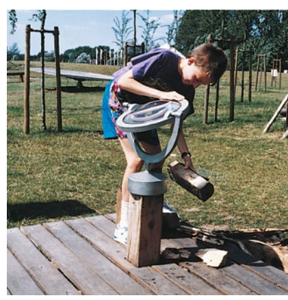
The picture shows the magnifying lens without table.