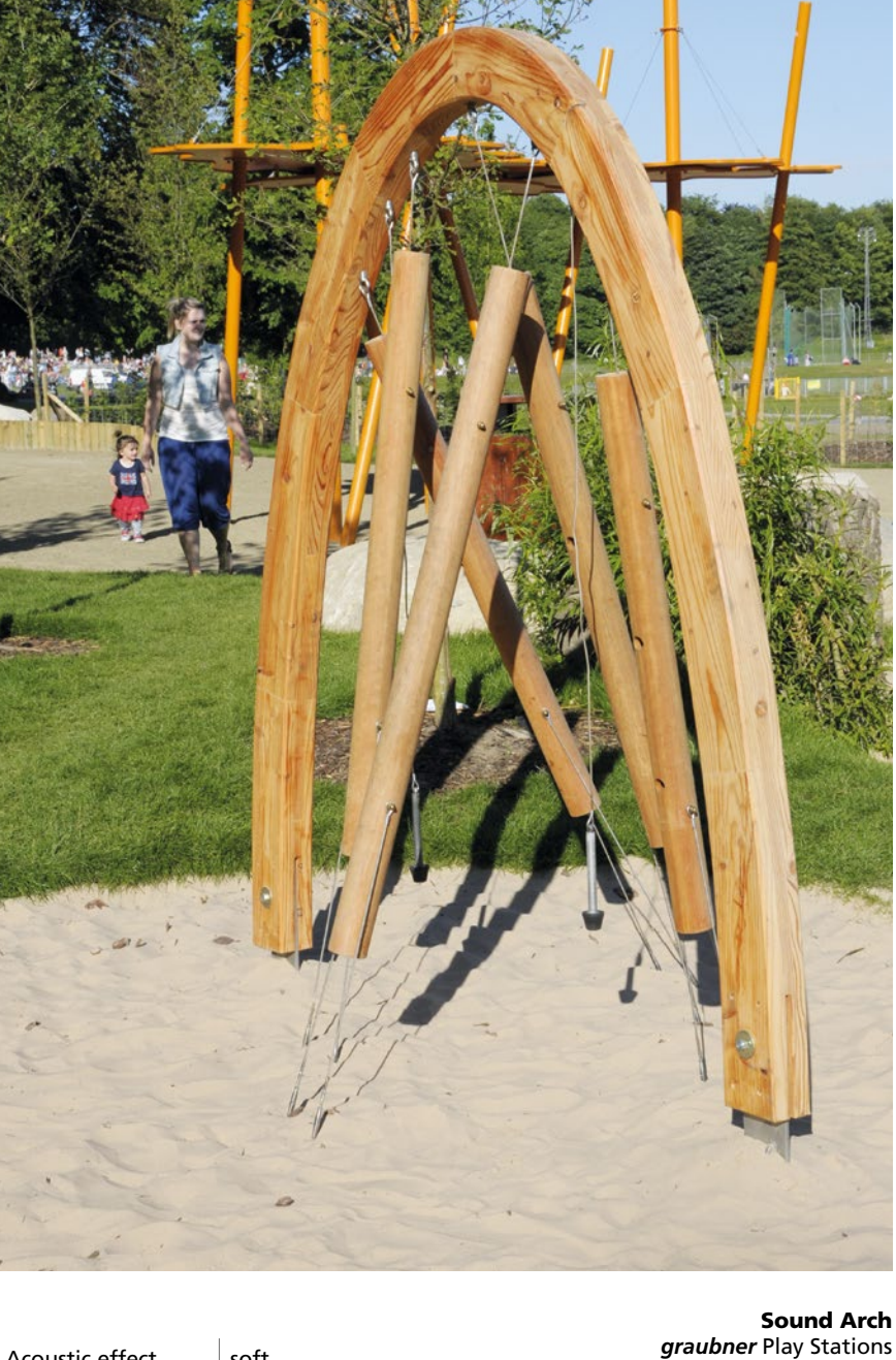
soft Acoustic effect slightly Vandalism vulnerable Supervision not necessary Explanation Board not necessary indoors and Installation outdoors Safety check not necessary (DIN ÉN 1176) Installation in possible concrete