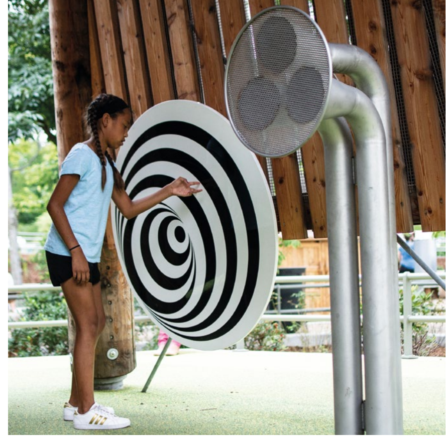
Order No. 10.55100 Echo Game with Order No. 10.22500 Rotating Disc, Photo © Daniel Perales