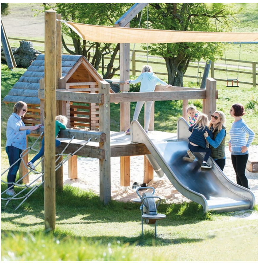
Order No. 4.14916, Special version with sun sail