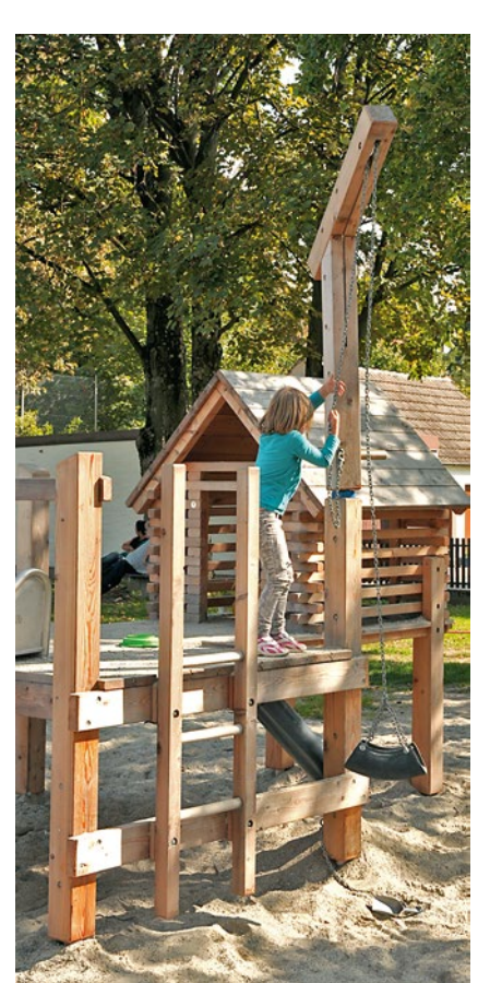
Order No. 4.14914, Special version with smooth roof claddina