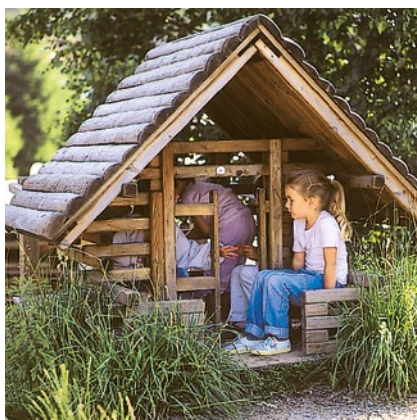
Order No. L4.10110 Small Play House with Door

Small Play House Small Play House with Door Big Play House Big Play House with Door